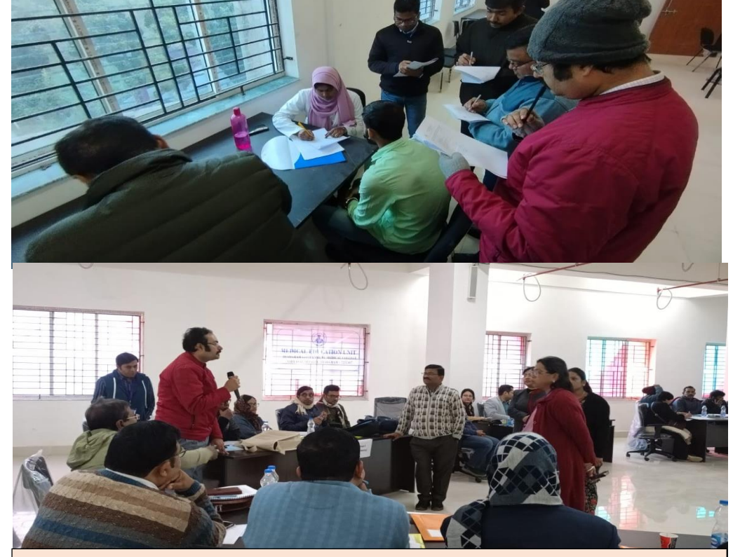
Interaction with participants during group activity of BCME training programme at JGMCH, Jhargram. 22^{nd} - 24^{th} January, 2024.